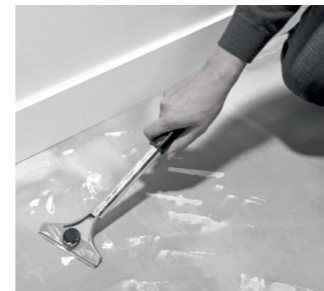
Sub floor surface hard, smooth, dry and free of cracks.