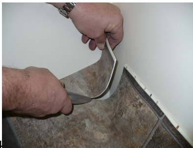
4 Make relief cuts at inside corners.