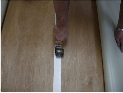
10 When installing over concrete position Tarkett S860 Seam Tape so it is centered under seam cut.