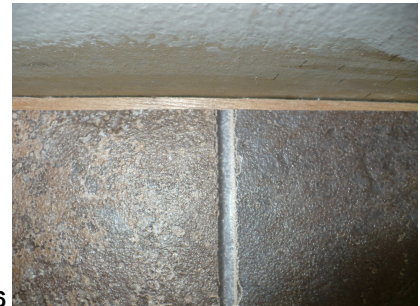
6 Leave a 1/8"-1/4" gap around all vertical areas (walls, cabinets, pipes, etc.).