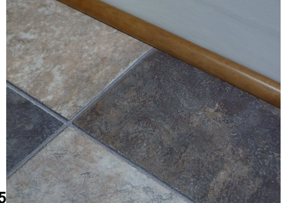
15 Install base board, quarter round or cove base to cover gap at perimeter. Nail into wall, not into the floor.