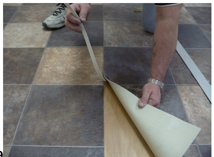
9 Remove bottom salvage piece.