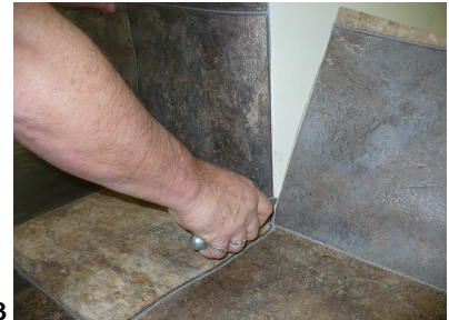
3 Using a sharp utility knife, make relief cuts at outside corners.