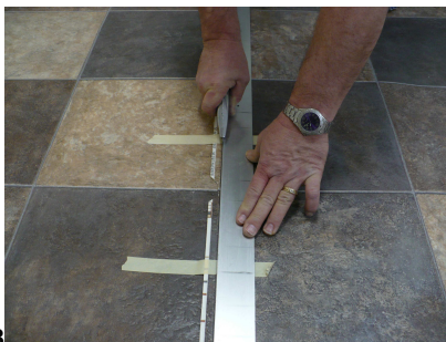
8 Place pieces of masking tape over seam edge to prevent movement. Using a sharp utility knife, double-cut through both pieces of flooring.