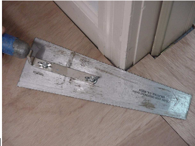
1 Undercut door moldings and casings. Sweep or vacuum substrate to remove dirt and debris.