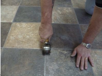
13 Position seam and roll with hand roller.