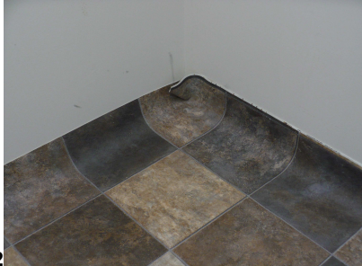
2 Position flooring squarely in room. Allow approximately 3" up the walls to allow for trimming.