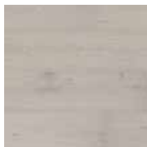
Elegance Oak Sterling