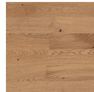
Pure Oak Rustic DuoPlank