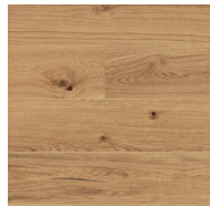
Pure Oak Rustic Plank XT