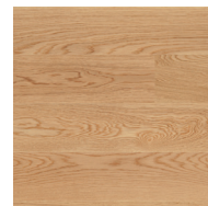
Pure Oak Nature MidiPlank

The pictures only present the colour of the floor. For more details regarding grading and variations see the Grading Book or www.tarkett.com . Tarkett's international range of floors comprises many different products. Some of these may not be for sale in your country. Although every care has been taken to reproduce images that reflect the finished product, the quality of monitor and printer and the nature of wood results in variations in the color and structure of individual planks. When sanding a wooden floor the appearance will change in colour, texture and surface effects.