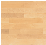
Pure Birch TreS

1: Betula Pendula, 2: Fraxinus Angustifolia, 3: Fagus Sylvatica, 4: Quercus Robur & Quercus Petraea