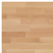
Pure Beech Nature TreS