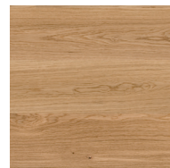
Pure Oak Nature Plank