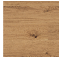
Pure Oak Rustic Plank