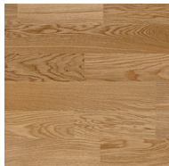
Pure Oak Nature DuoPlank