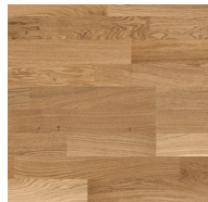
Pure Oak Nature TreS