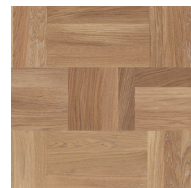
Noble Oak Art Deco