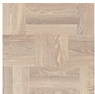
Noble Oak Scandinavia