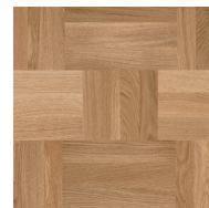
Noble Oak Retro