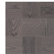
Noble Oak Bronx

The pictures only present the colour of the floor. For more details regarding grading and variations see the Grading Book or www.tarkett.com . Tarkett's international range of floors comprises many different products. Some of these may not be for sale in your country. Although every care has been taken to reproduce images that reflect the finished product, the quality of monitor and printer and the nature of wood results in variations in the color and structure of individual planks. When sanding a wooden floor the appearance will change in colour, texture and surface effects.