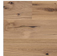
Heritage Oak Blonde