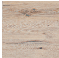
Heritage Oak Lime Stone