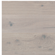
Heritage Oak Urban Grey