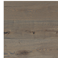
Heritage Oak Old Grey