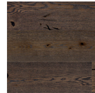
Heritage Oak Old Brown

The pictures only present the colour of the floor. For more details regarding grading and variations see the Grading Book or www.tarkett.com . Tarkett's international range of floors comprises many different products. Some of these may not be for sale in your country. Although every care has been taken to reproduce images that reflect the finished product, the quality of monitor and printer and the nature of wood results in variations in the color and structure of individual planks. When sanding a wooden floor the appearance will change in colour, texture and surface effects.