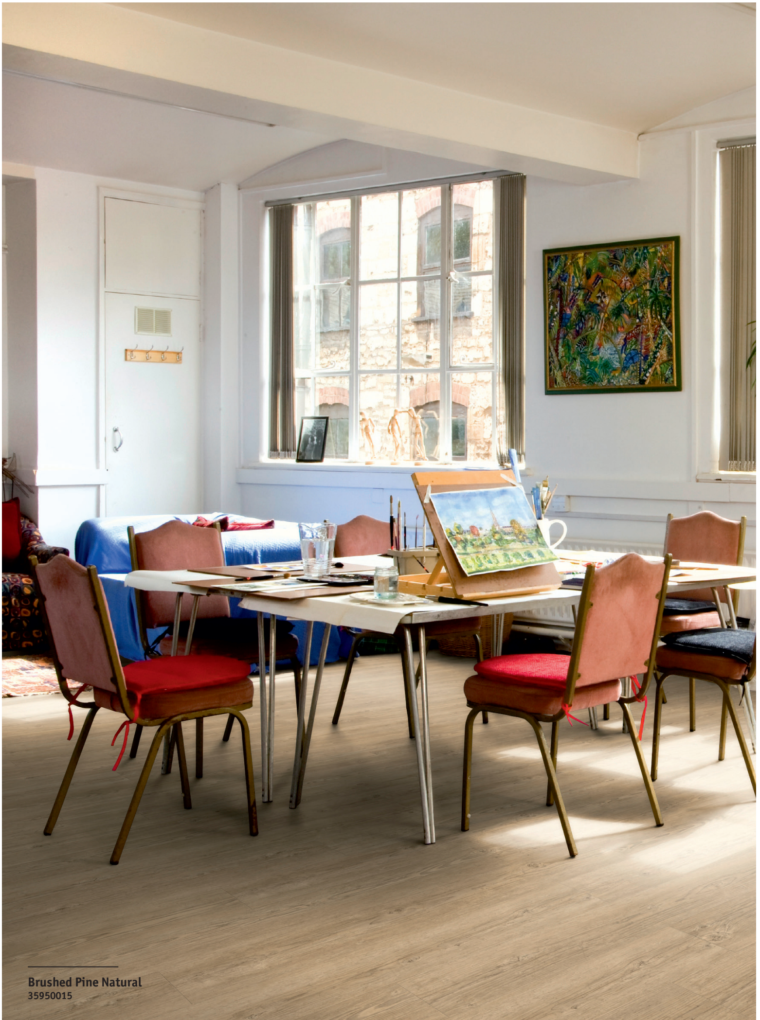
Brushed Pine Natural 35950015