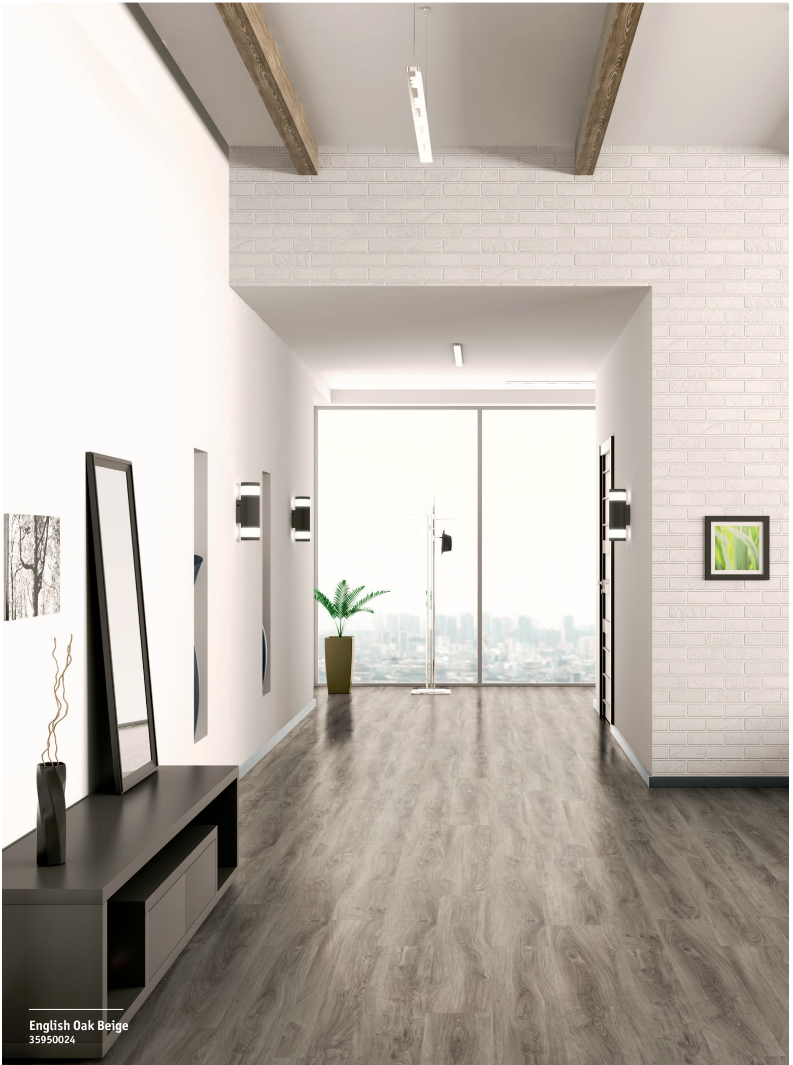
English Oak Beige 35950024