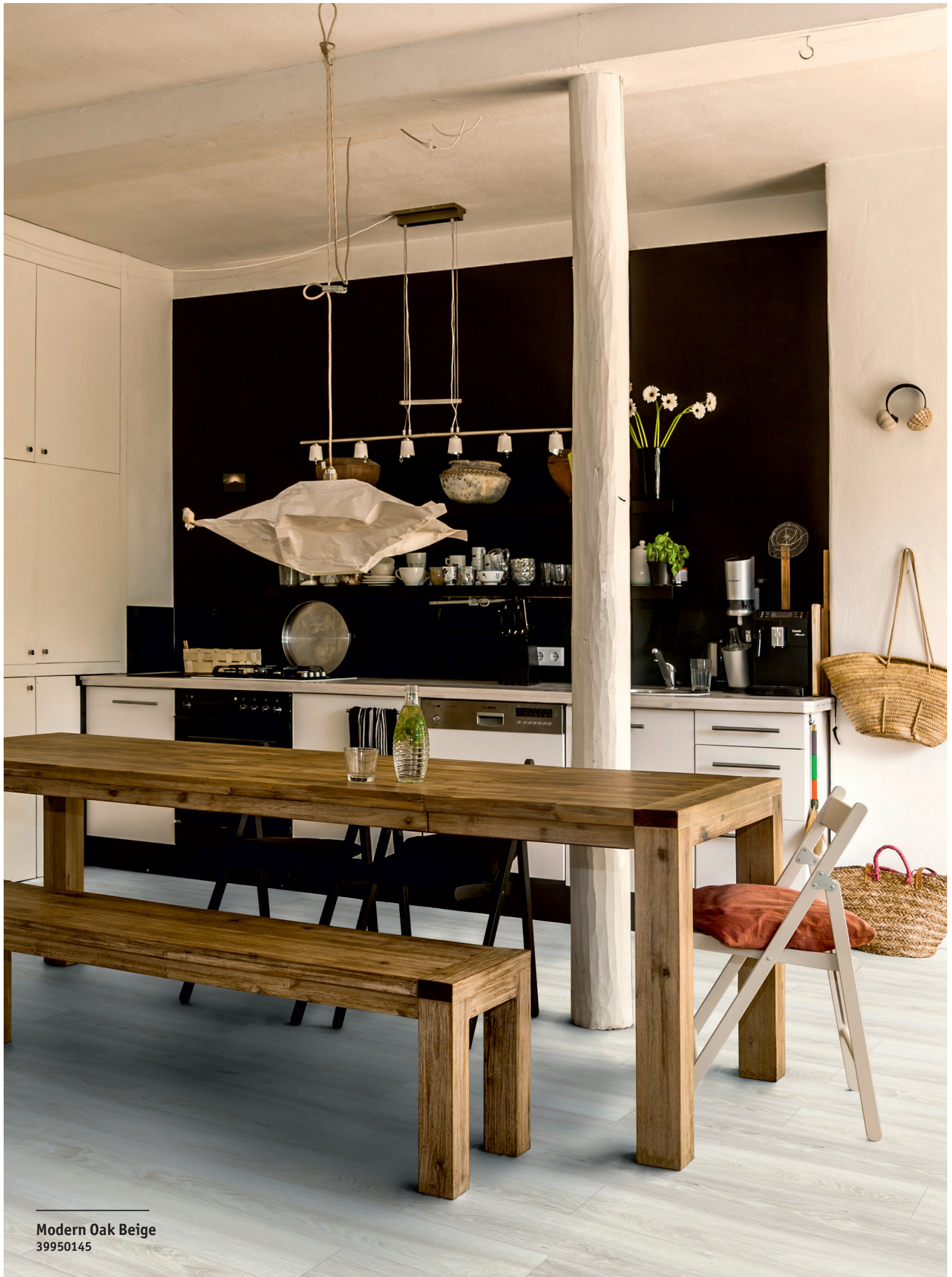
Modern Oak Beige 39950145