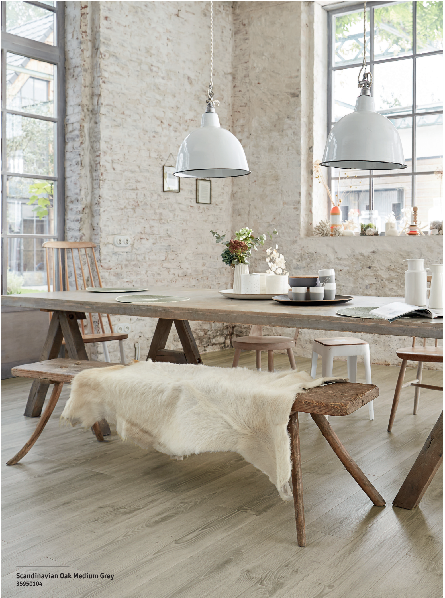
Scandinavian Oak Medium Grey 35950104