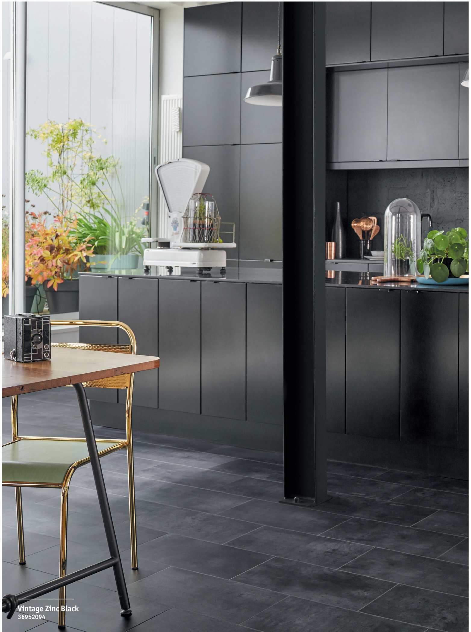
Vintage Zinc Black 36952094