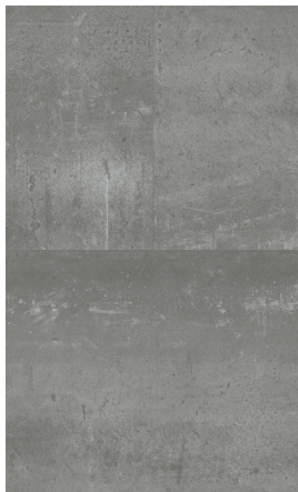
Cool Grey 35952073