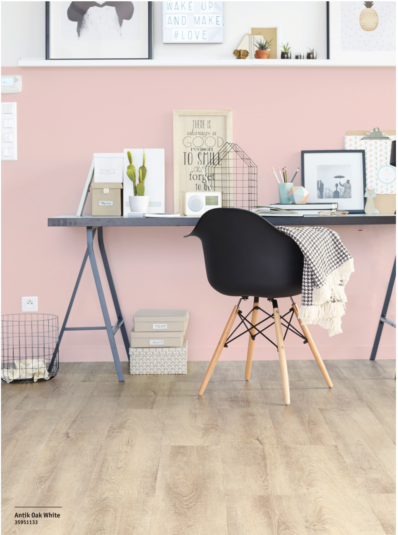
Antik Oak White 35951133