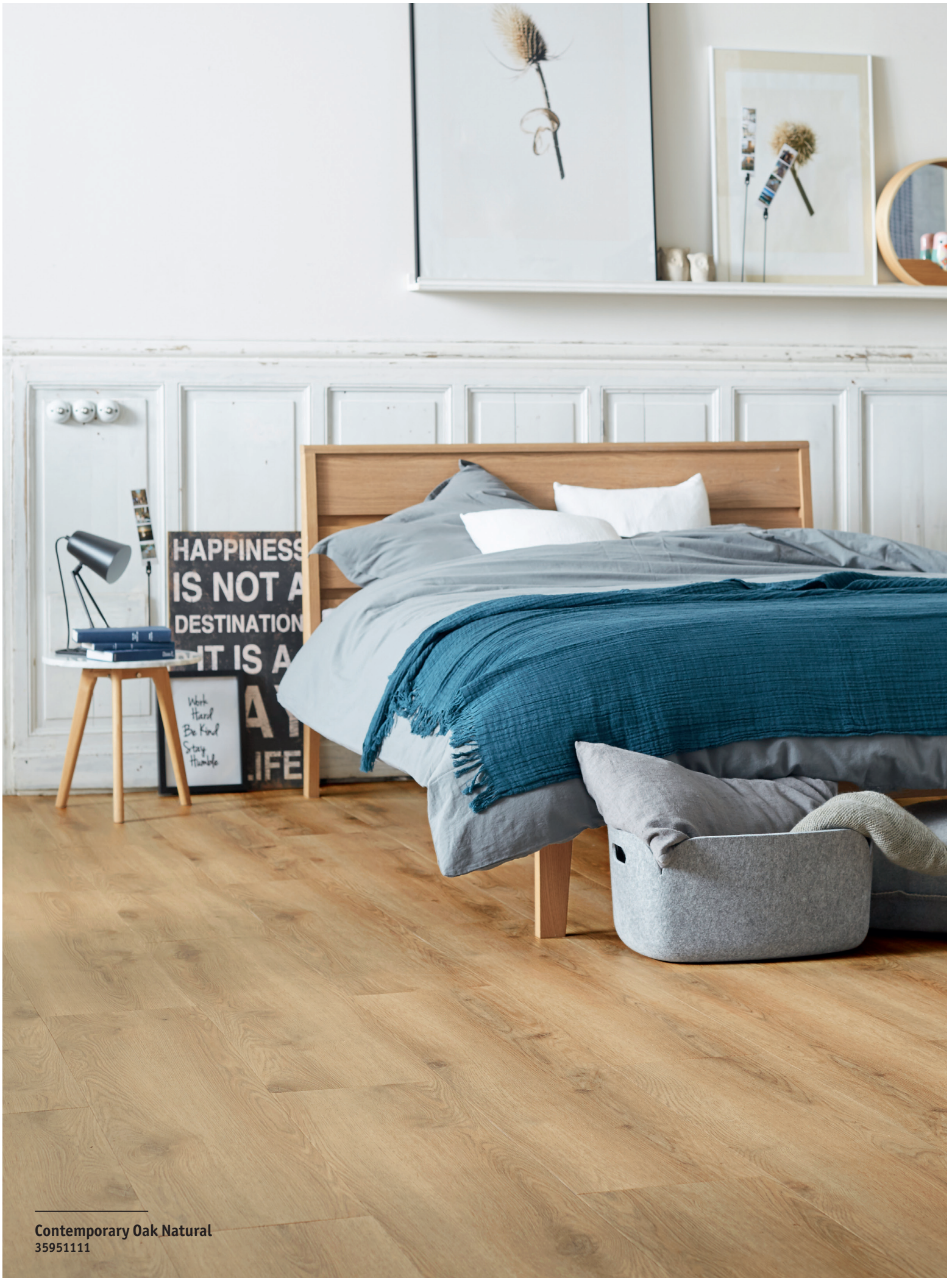
Contemporary Oak Natural 35951111