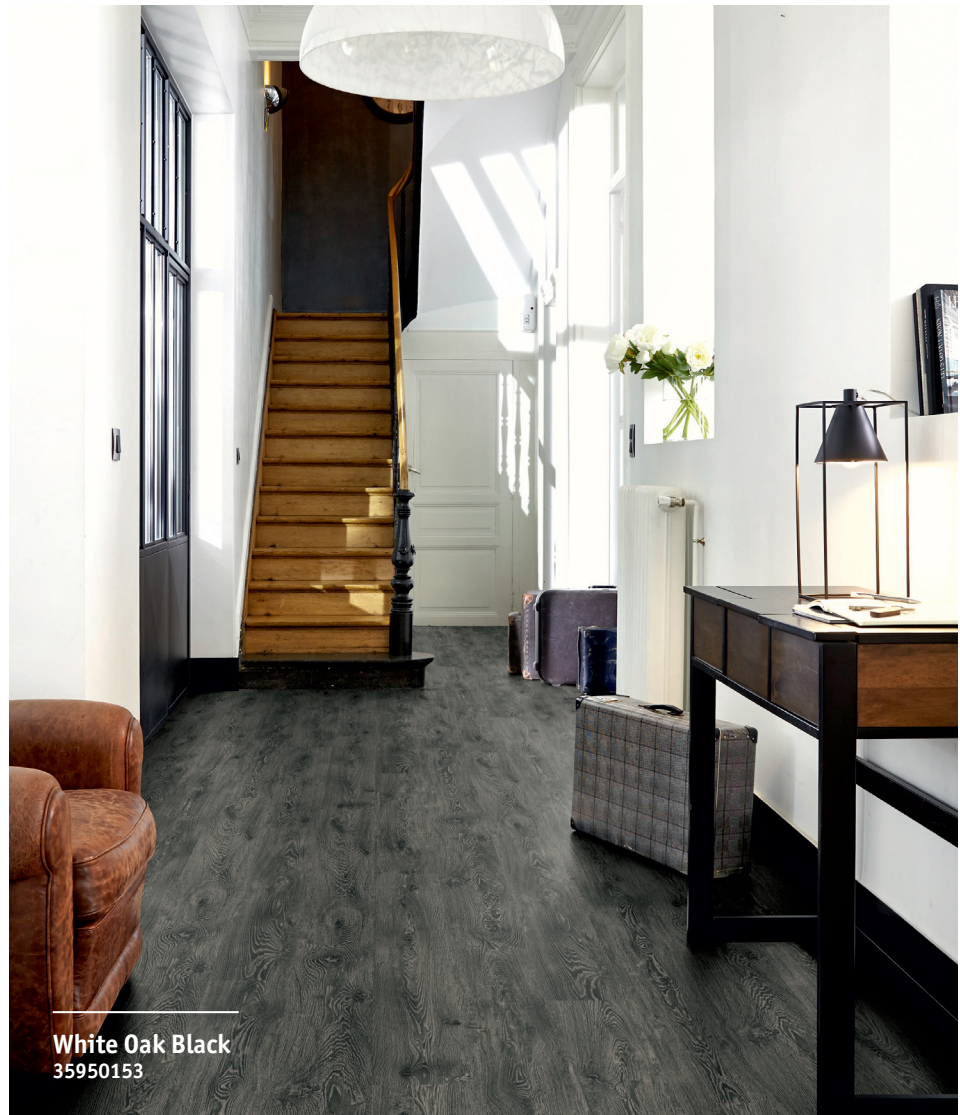
White Oak Black 35950153